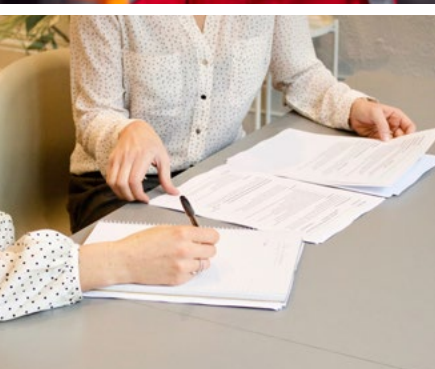
Continuous improvement to ensure compliance with the ZWILLING Supplier Code of Conduct.