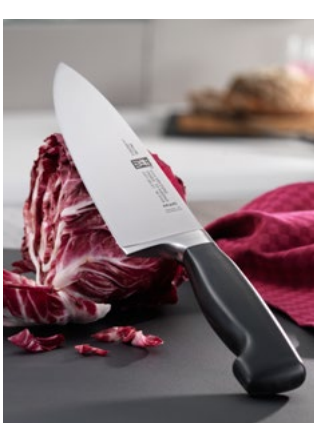
ZWILLING strives towards sustainable products and packaging by generating less waste and using more recycled materials.