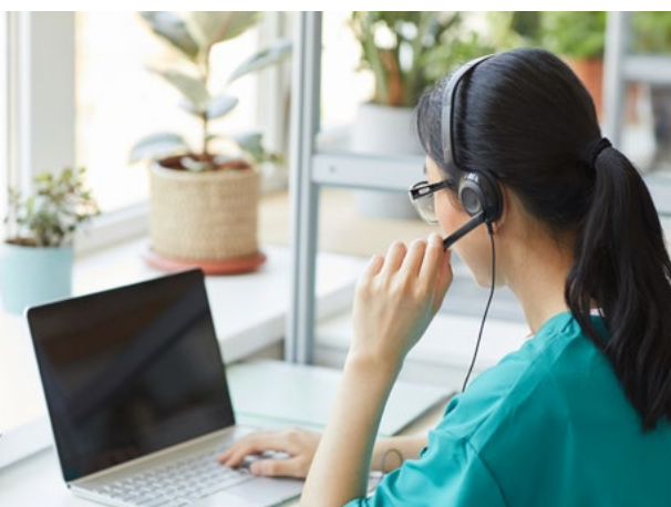
Training and awareness raising as important Compliance pillar.